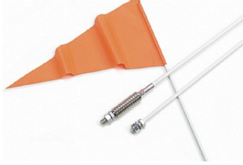
FLAG WHIP £ 9.95